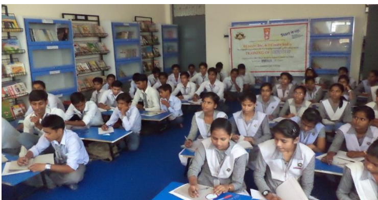
Students of Harbilas Goyal Inter College, Ujhani during the CMS session.