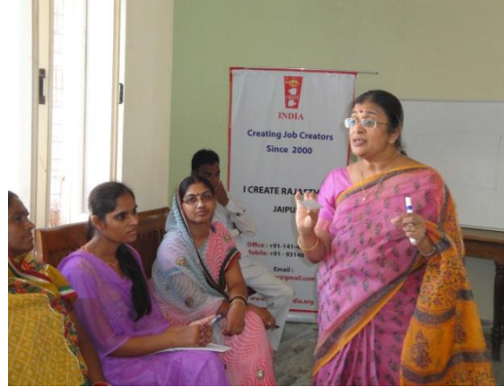
Participants of HBS Trust listening attentively