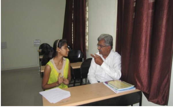
Participants during the Networking Session at the Faculty of Family and Community Sciences