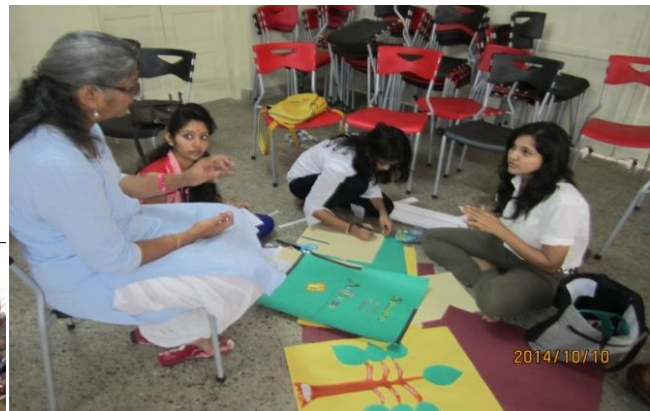
Participants of Dr. Bhanuben Nanavati Career Development center planning their Business Plan.