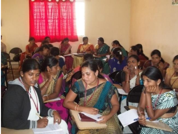
Staff of SKDRDP during the session