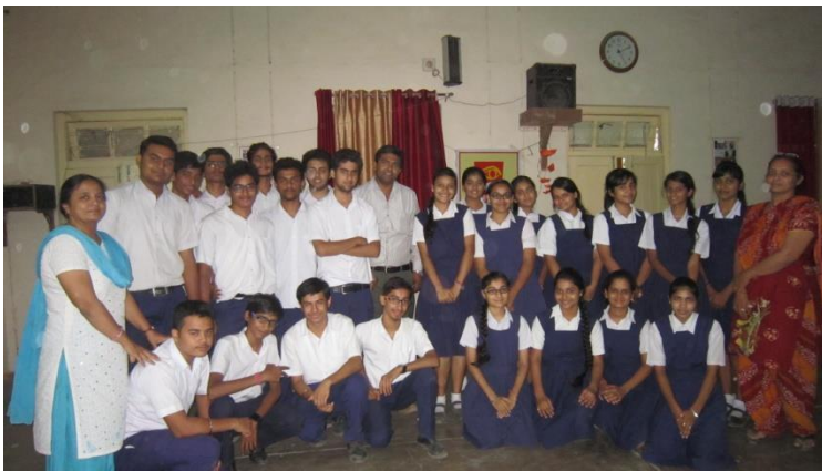
Students of Baroda High School after the Business Plan Competition