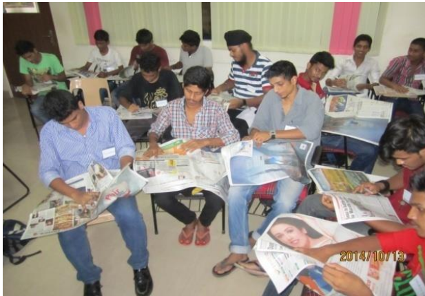
ITI students doing the Newspaper Exercise