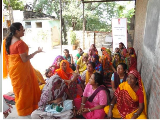
SOS Village Women during the session